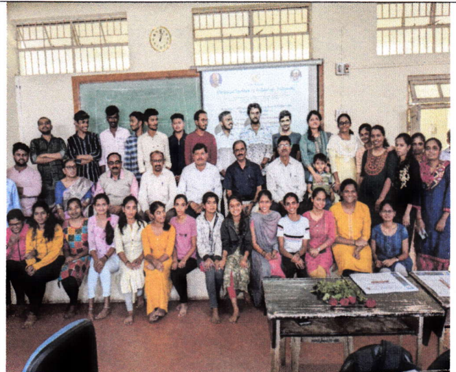
Valedictory Function of STTP on Day 4