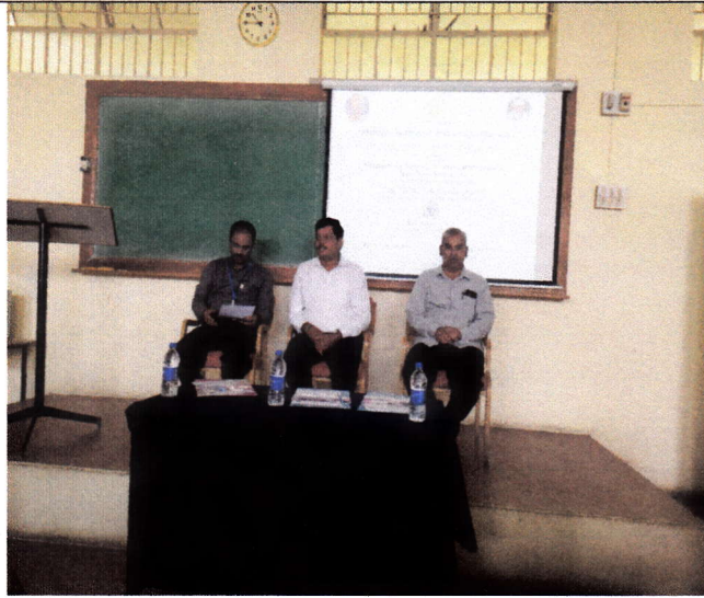
Inaugural Function of STTP Day 1