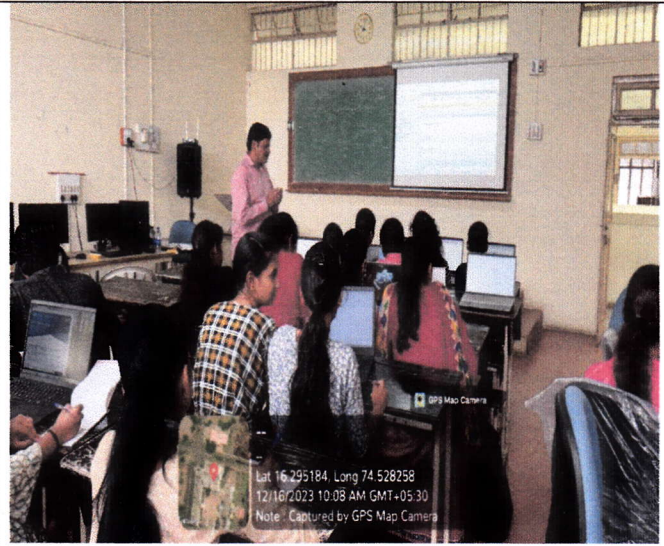
Resource Person taking session on Day 2 of STTP