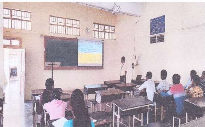
4. PPT Presentation by Dr.M.C.Sarasamba along With Participants