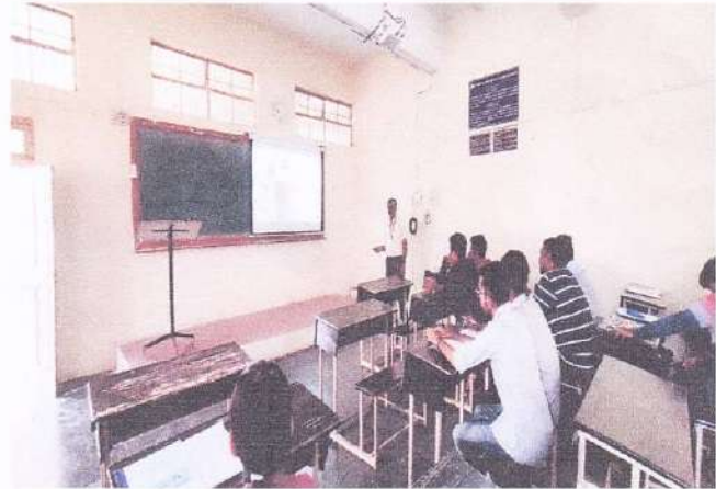
2. Students participants attending the lecture