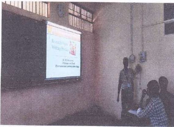
1. Dr.M.C.Sarasamba delivering the lecture