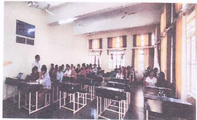
2. Participants attending the lecture