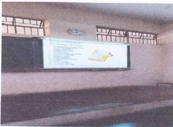
3. PPT presentation by Dr.M.C.Sarasamba