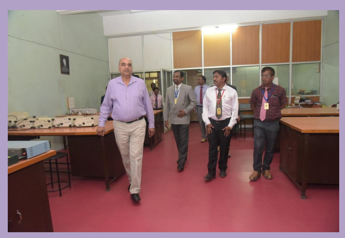
Visit to the various laboratories of the Department