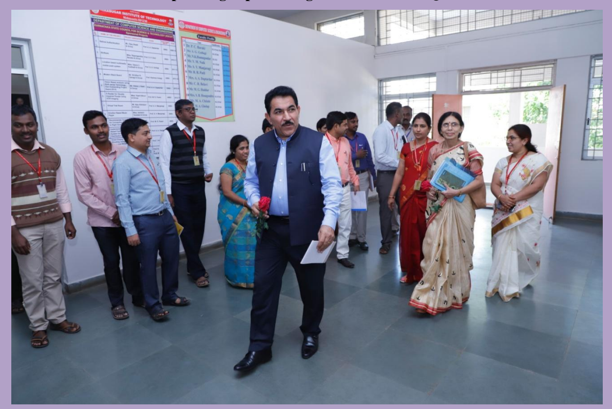
Visit to the Department of Computer Engineering