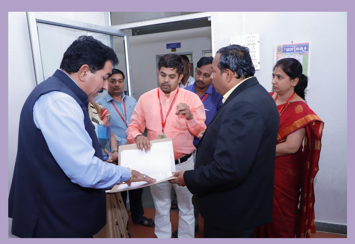
Document verification during department visit