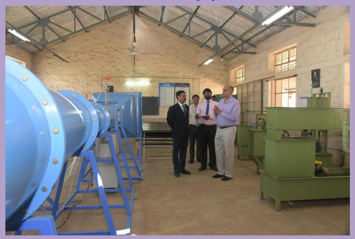
Visit to the various laboratories of the Department