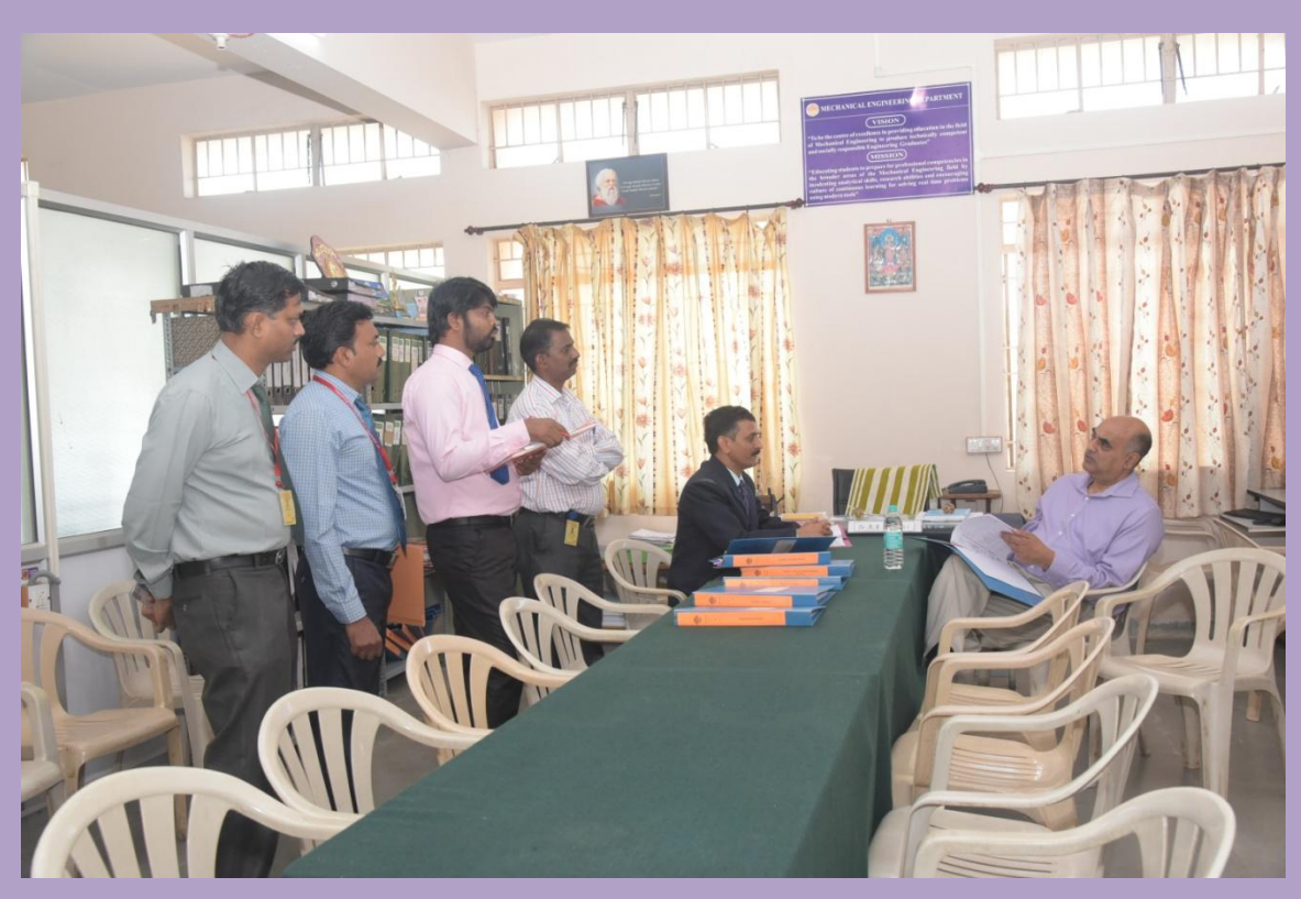
Document verification during department visit