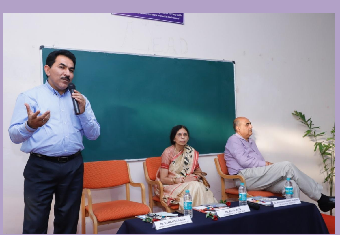
Interaction of NAAC Peer Team with Teaching & Non-Teaching staff members