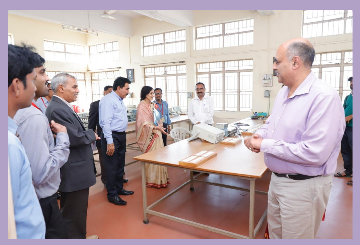
Visit to the various laboratories of the Department