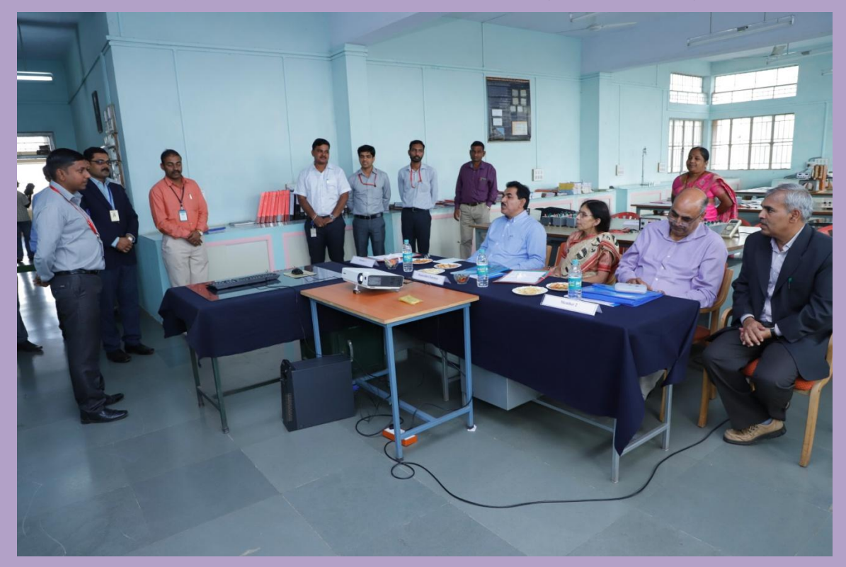
Visit to First Year Engineering