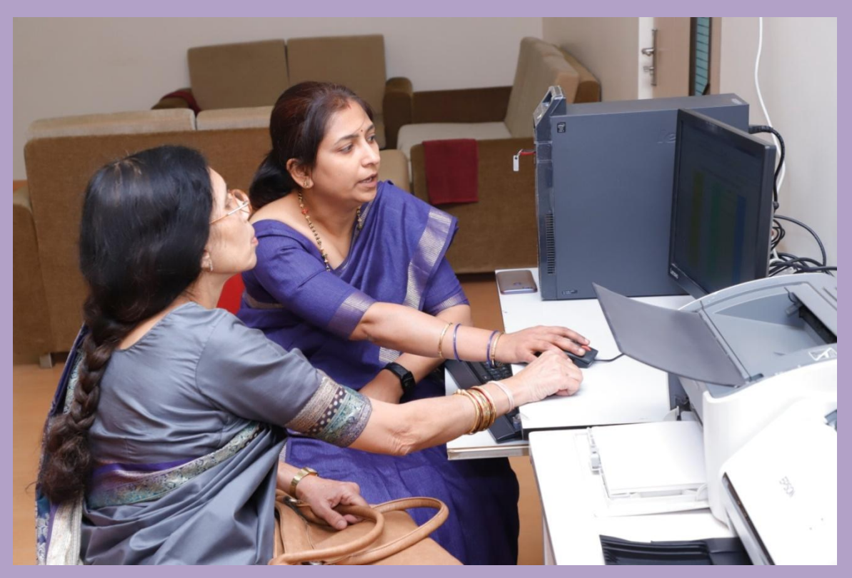
Discussion with NAAC Pear Team Finalizing Peer Team Report