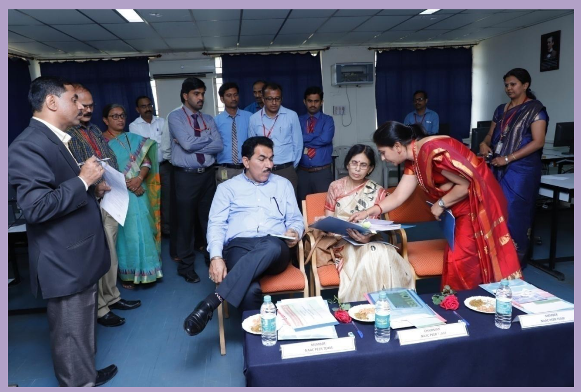
Document verification during department visit