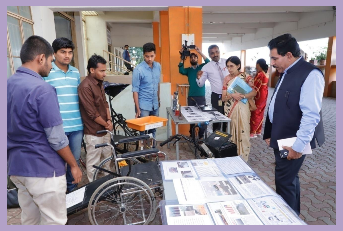
Project Exhibition by students