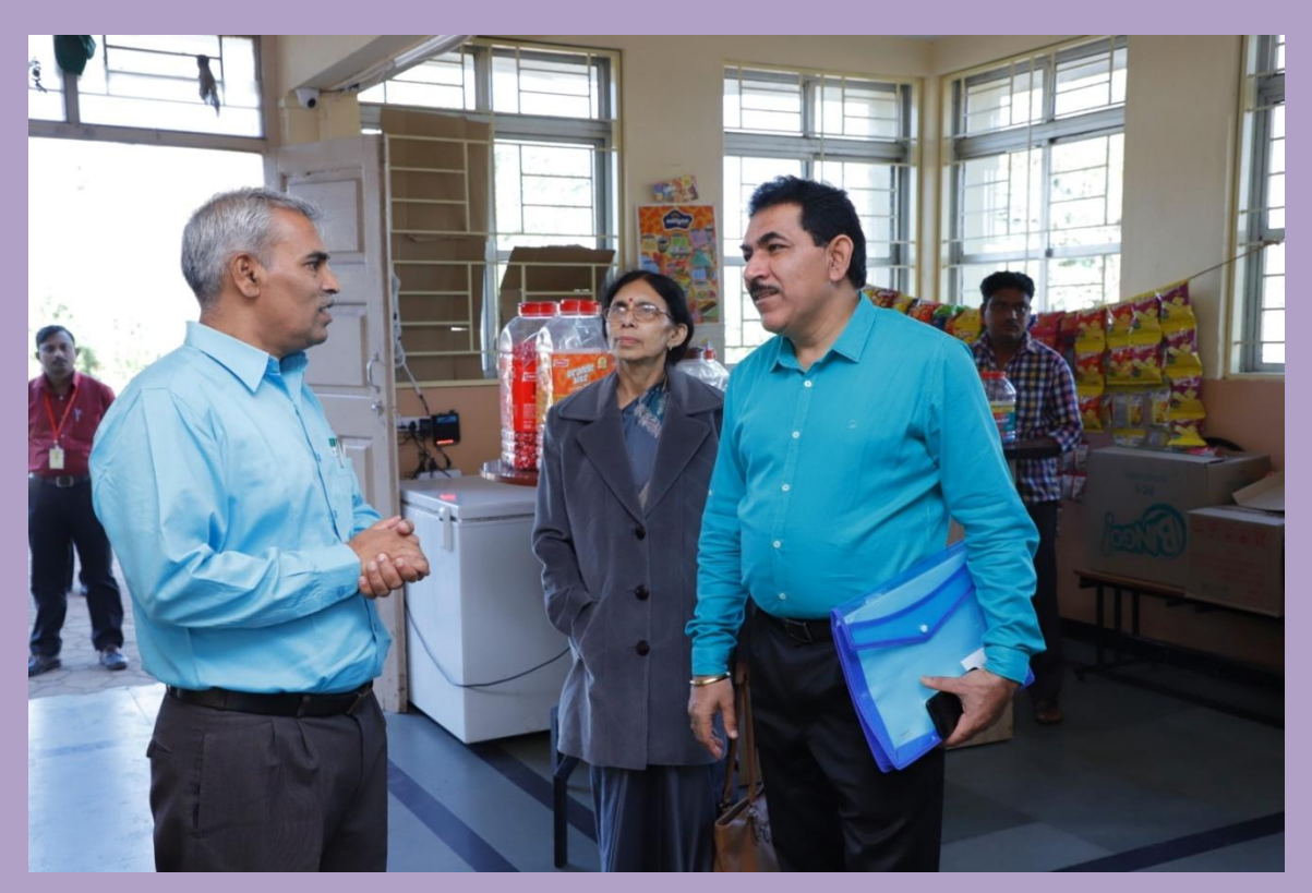
Visit to the College Canteen