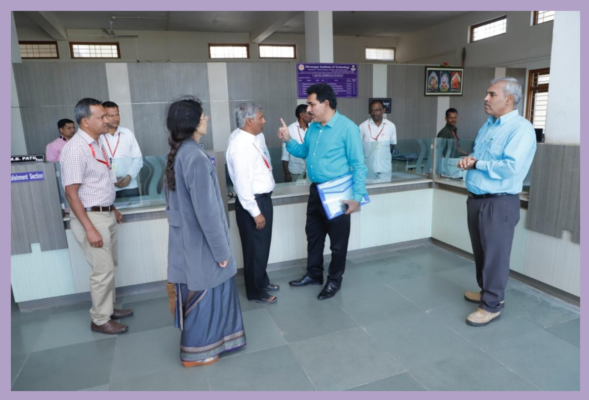
Visit to the office for document verification