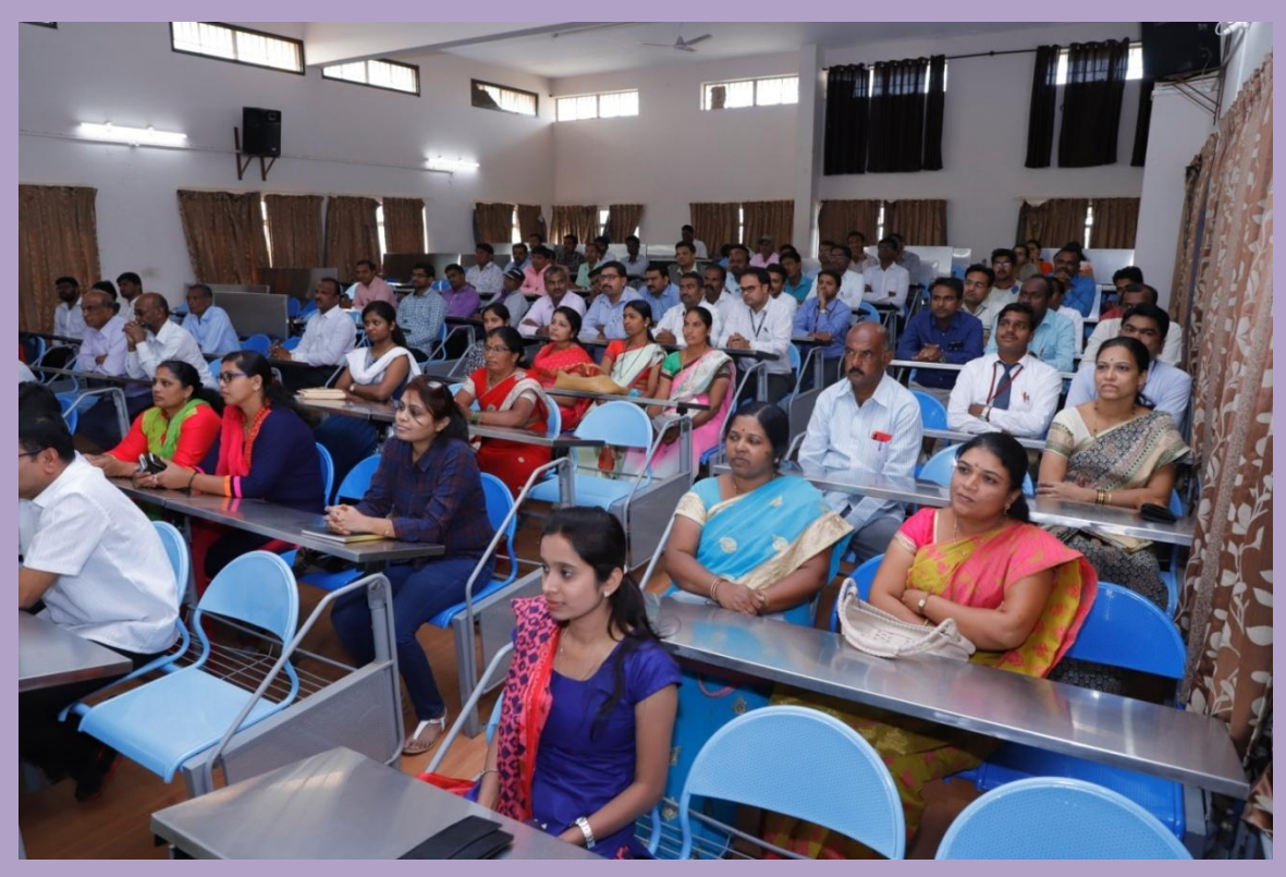
NAAC Peer Team Interaction with Parents & Alumni