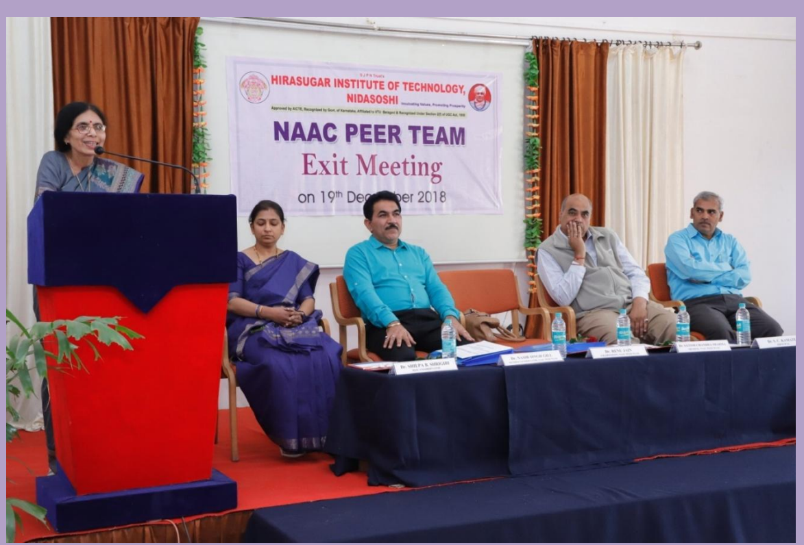
Chairman addressing the staff during Exit Meeting