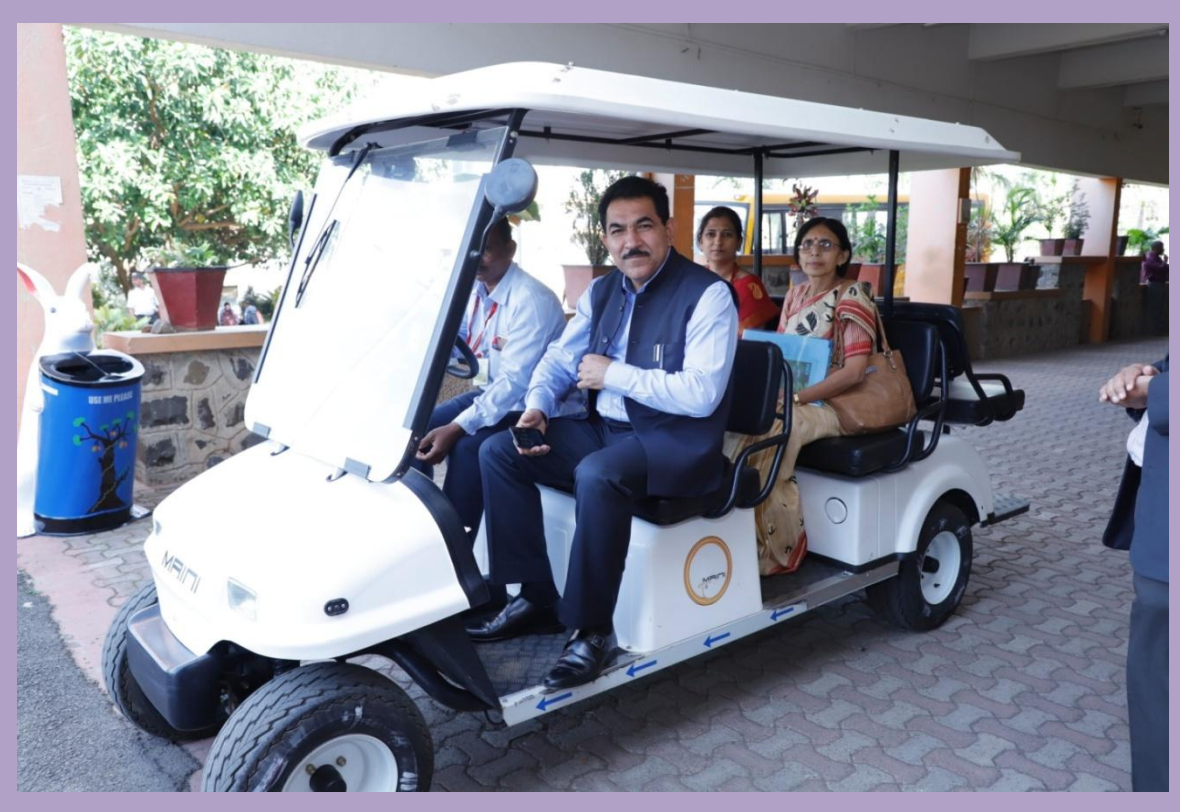
On the way to NAAC Peer Team Luncheon Meeting with the Management