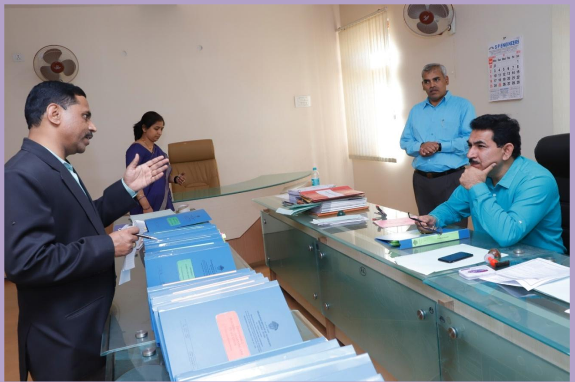
Checking Documentary Evidences