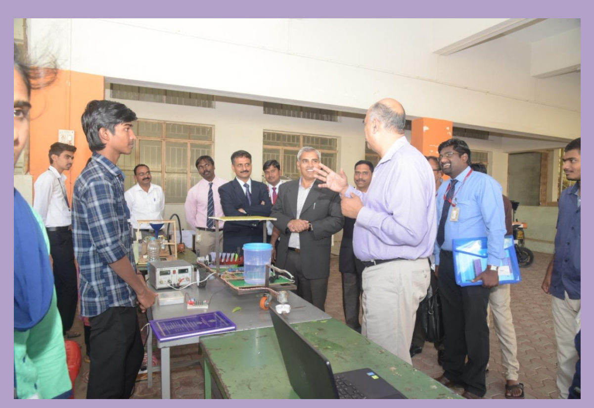
Project Exhibition by students