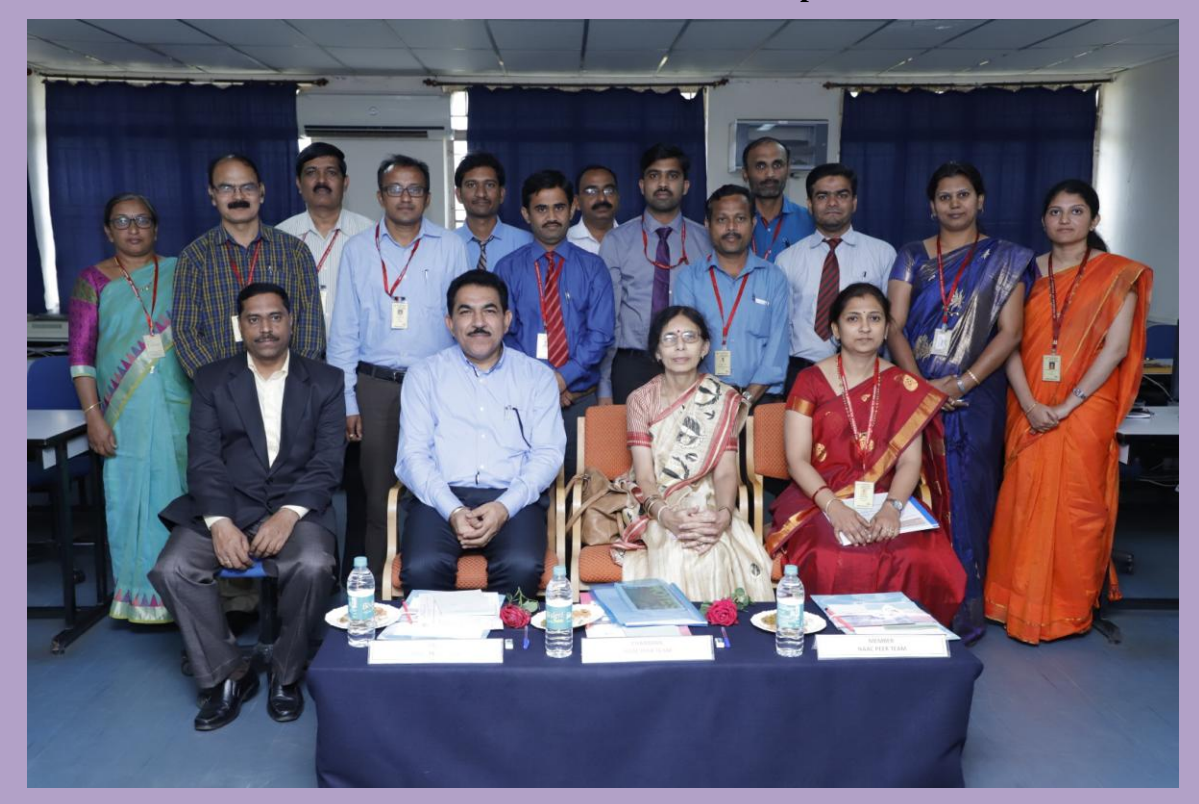
Staff Members of Department of Electronics & Communication Engg. with NAAC Peer Team