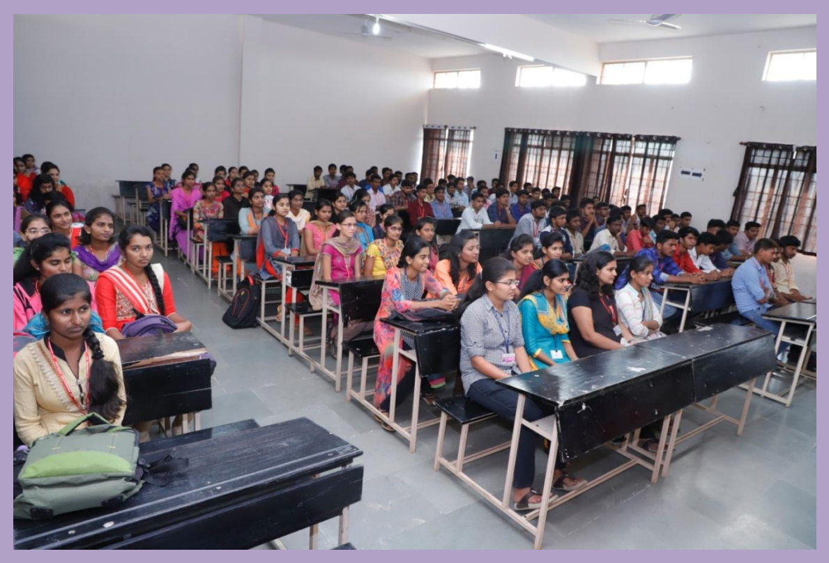
NAAC Peer Team Interaction with the students