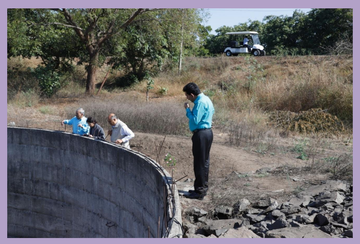
Visit to rain water harvesting area