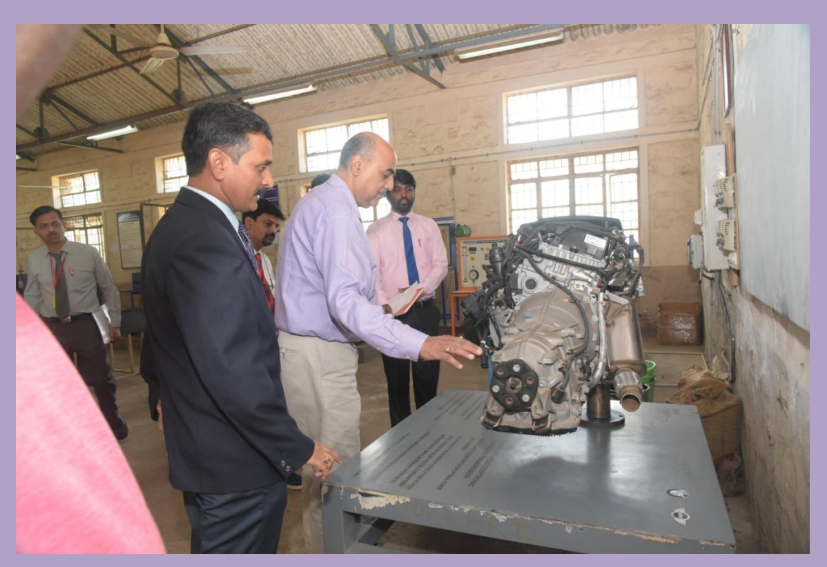
Visit to the various laboratories of the Department