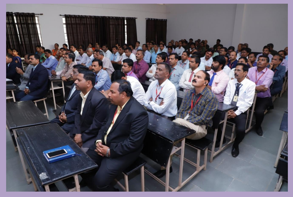
Interaction of NAAC Peer Team with Teaching & Non-Teaching staff members