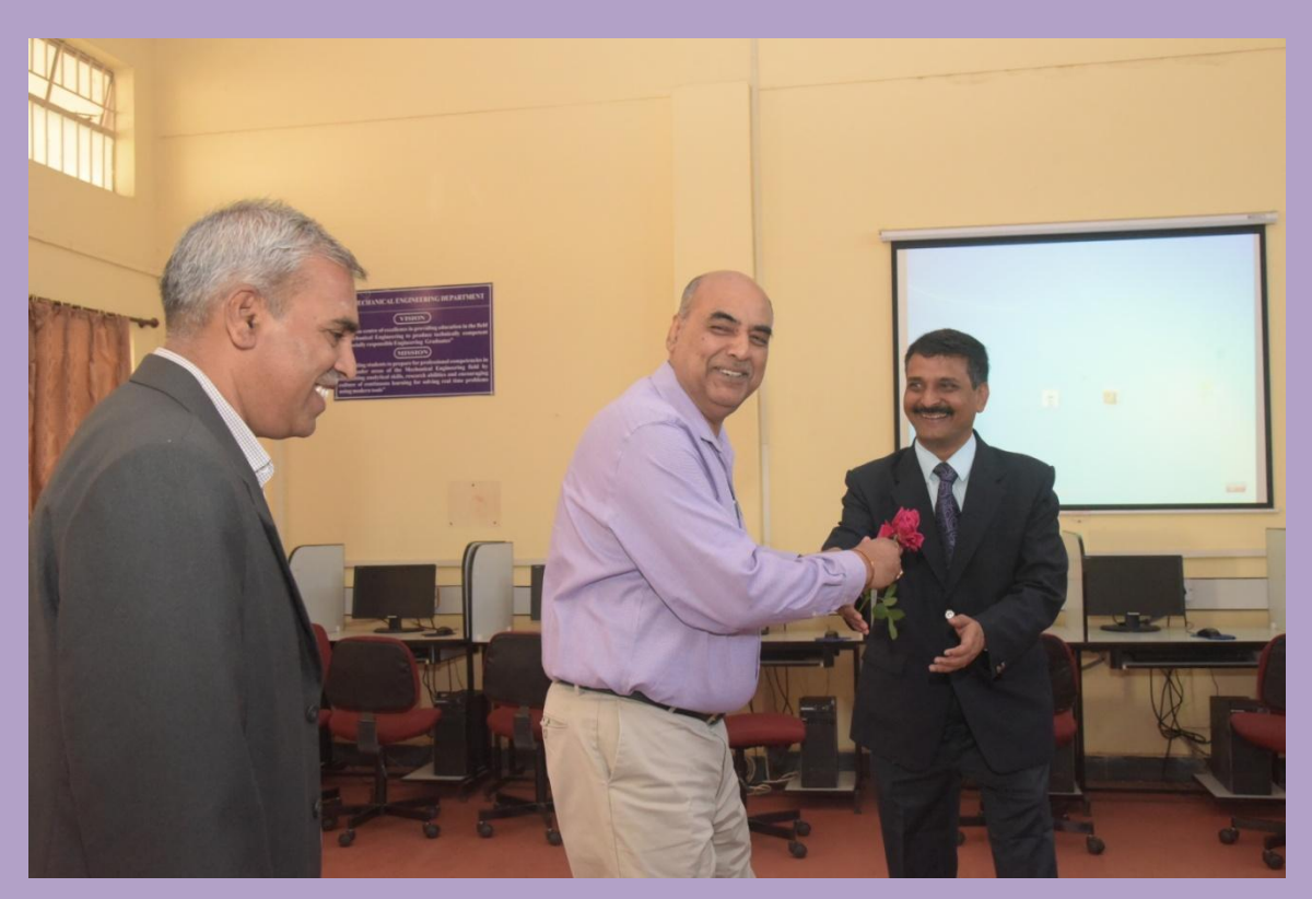
Visit to the department of Mechanical Engineering