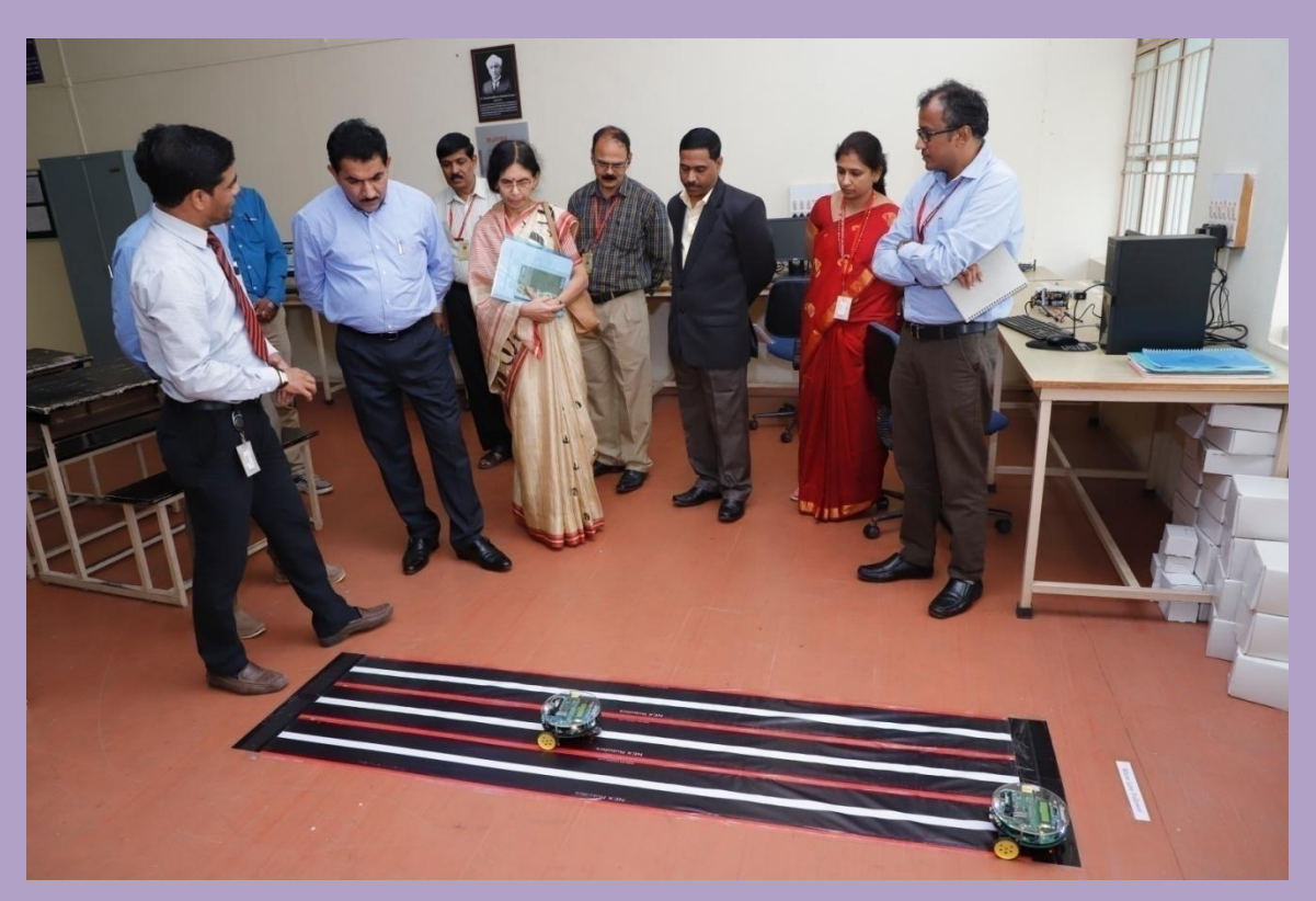
Demonstration of Robot Track