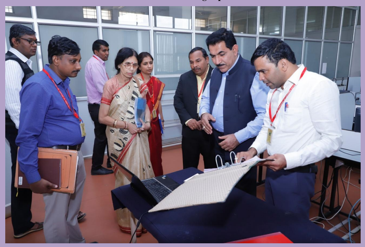
Visit to the various laboratories of the Department