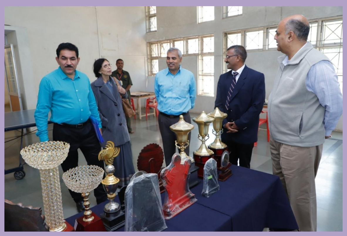
Visit to the Support Facilities