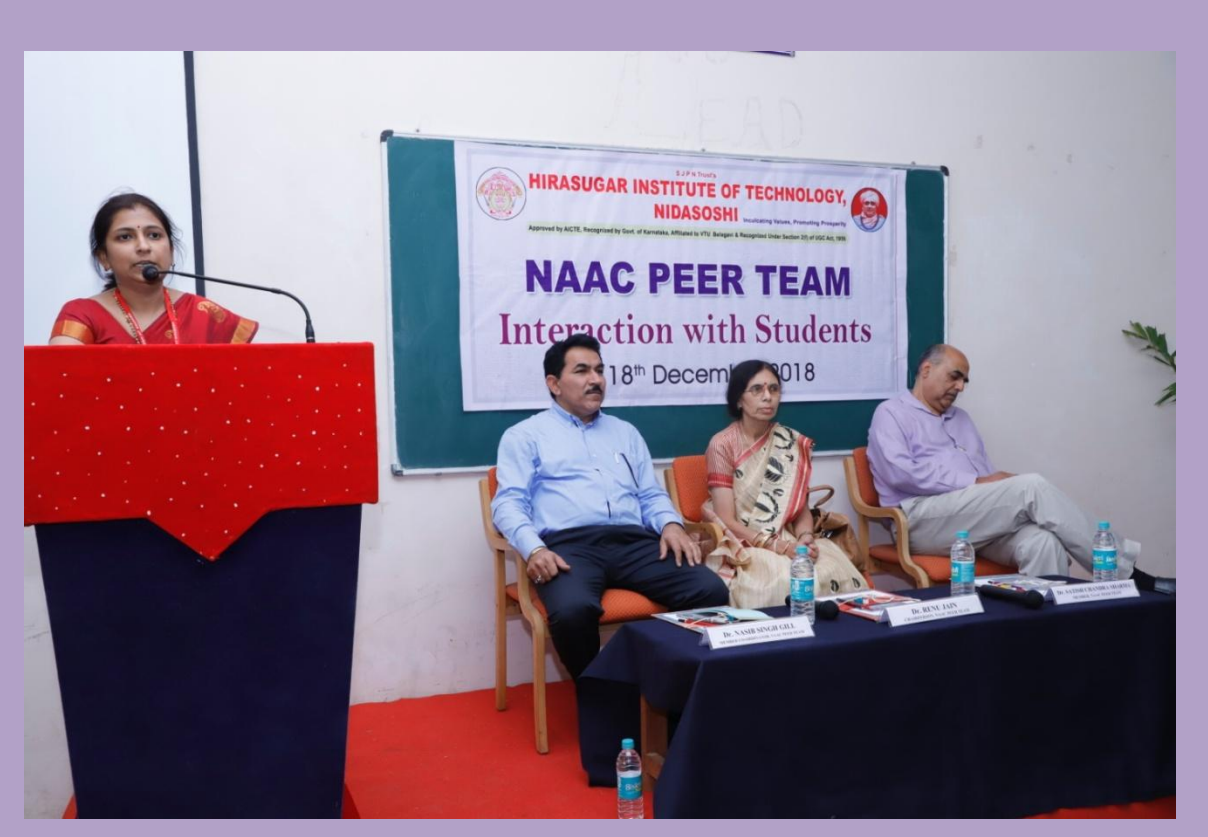
NAAC Peer Team Interaction with the students