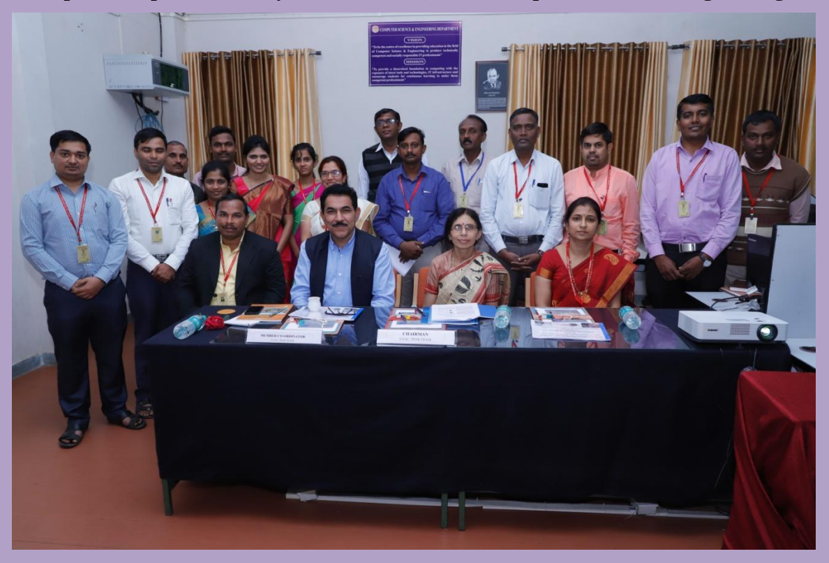
Staff Members of Department of Computer Engineering with NAAC Peer Team