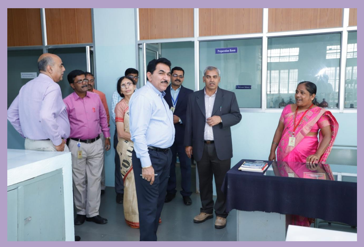
Visit to the First Year Engineering Laboratories