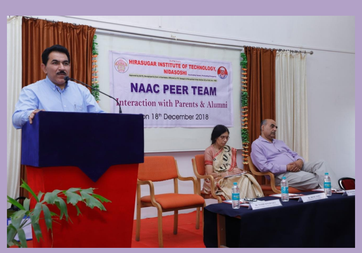
NAAC Peer Team Interaction with Parents & Alumni