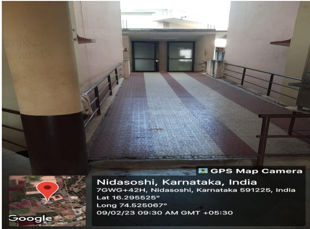
Ramp for Easy Access to Hostel