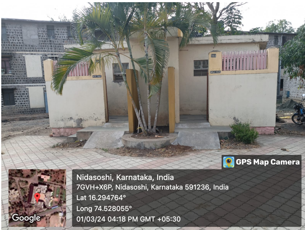
Ramp for Easy Access to Washroom