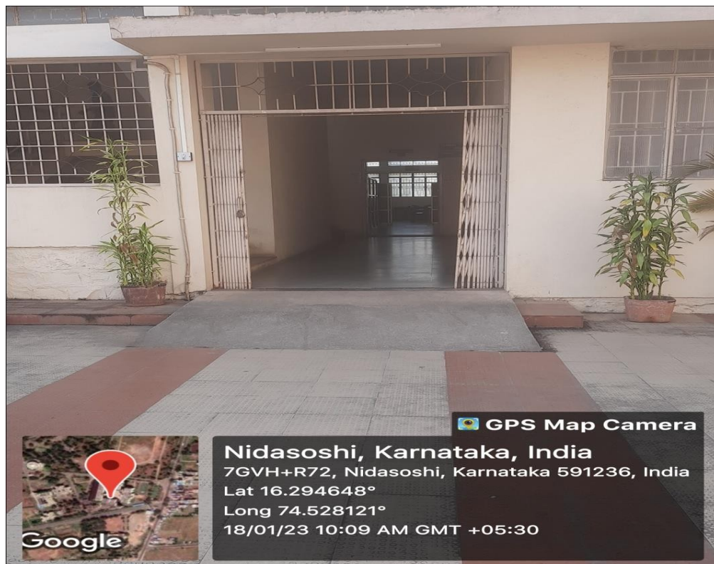
Ramp for Easy Access to Classrooms and Library