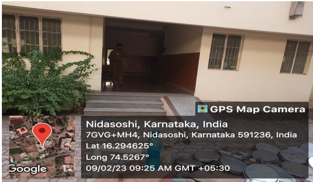
Ramp for Easy Access to Hostel