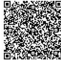
Girish V. Nandimath Global Head Talent Acquisition & AIP

Click here or use a QR code scanner from your mobile to validate the offer letter