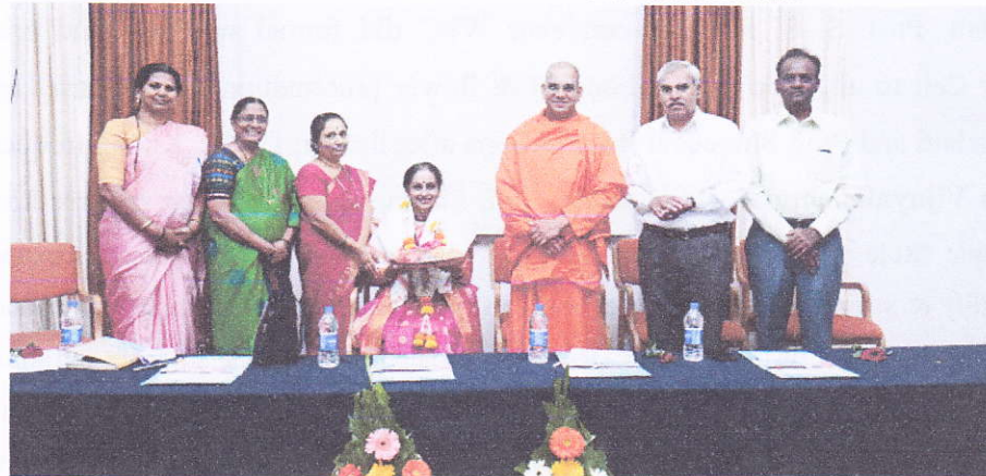
Felicitation of chief guest by the dignitaries