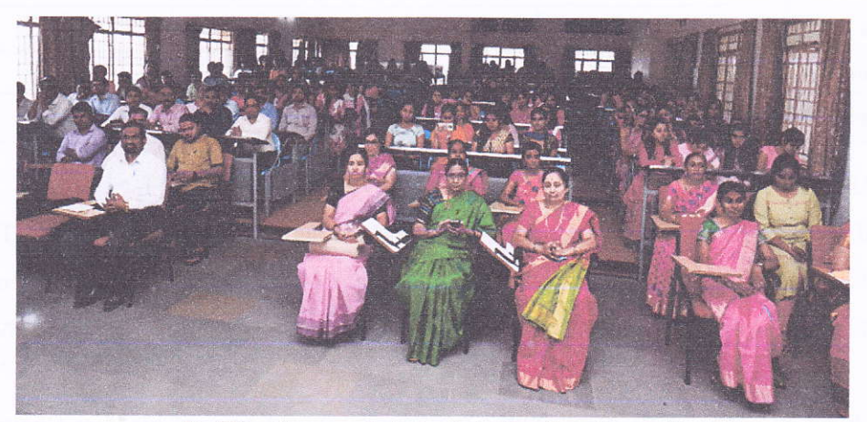
Staff invitees and students in the function hall