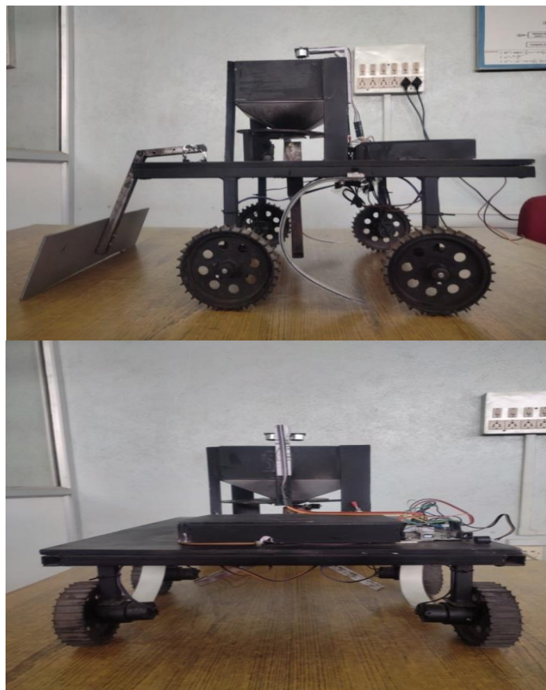
Fig.3 Prototype model

In this paper a battery operated vehicle for agriculture application has been designed. A 12V battery is connected to driver circuit to reduce the voltage as per requirement of Arduino UNO. Arduino UNO has been programmed in C language. Arduino UNO is programmed to run servo motor and dc motor. DC motor uses 12V and is used to run the vehicle. Servomotor is used for seed sowing mechanism. In this way the battery operated vehicle is used for seed sowing application.