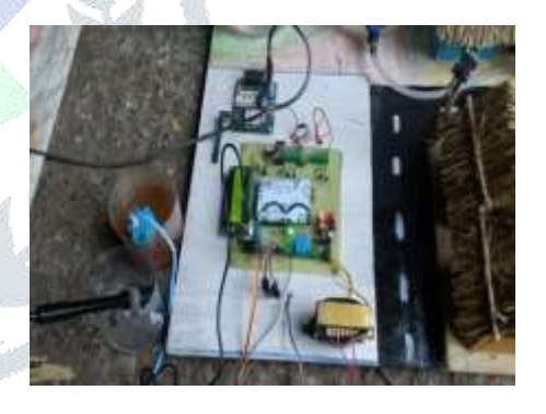
Fig: Hardware Design of Proposed System.