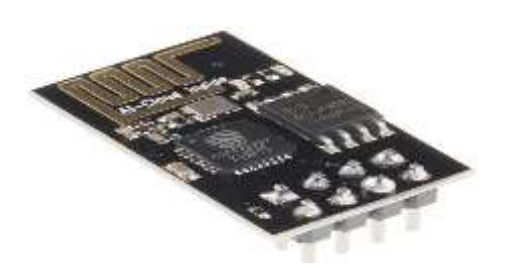
Fig 3: ESP8266 WIFI Module

The ESP8266 WIFI Module is a self-contained SOC with integrated TCP/IP protocol stack that can give any microcontroller access to your Wi-Fi network. The ESP8266 is capable of either hosting an application or offloading all Wi-Fi networking functions from another application processor.