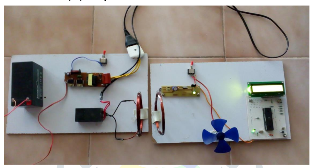
Fig 2: The Hardware module of proposed system.

The hardware module of our proposed system is as shown below.