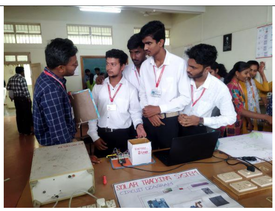
Students explaining about the mini-project