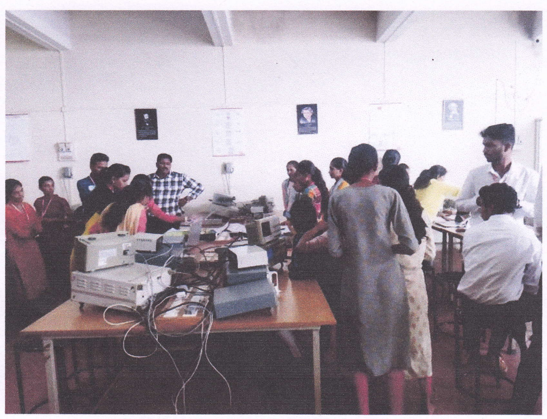
Students actively participated in the exhibition