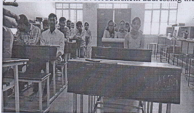
Students present during exhibition