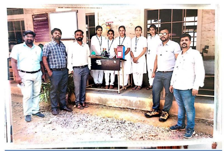
6. Best Out of waste Project Exhibition