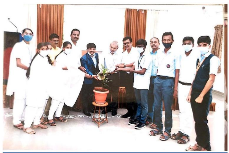
2. Inauguration of Event by Watering the Plant