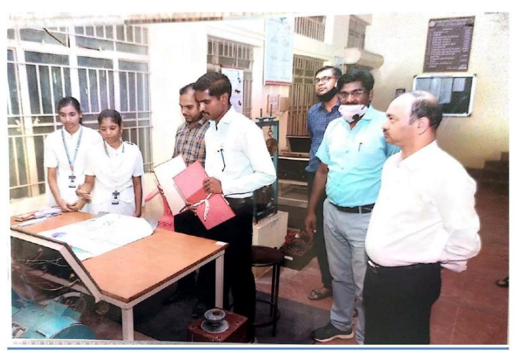
8. Poster Presentation Competition