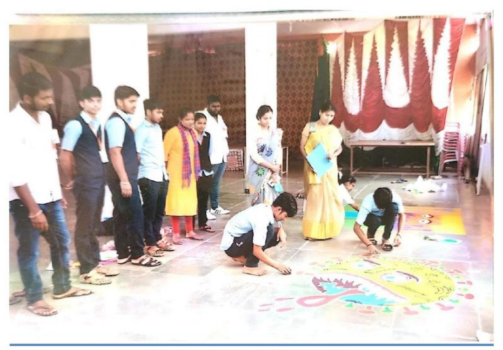
7. Science Rangoli Competition