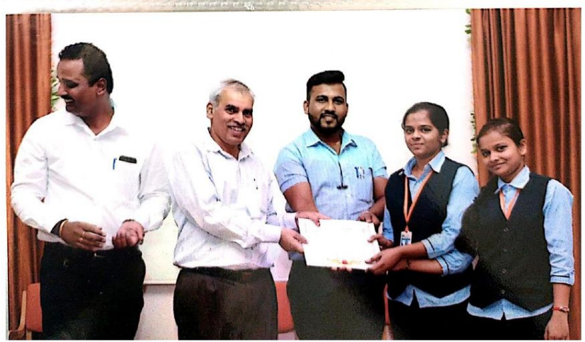
12. Prize Distribution