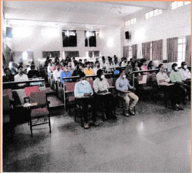
Participants are present during Seminar on Career Opportunities in Indian Air force held on 11 th August 2021 in Mechanical Seminar Hall.