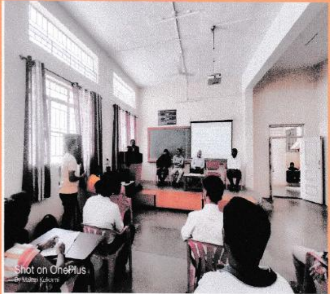
Participants are present during Seminar on Career Opportunities in Mechanical Engineering held on 1 st April 2021 in NBA Seminar Hall.