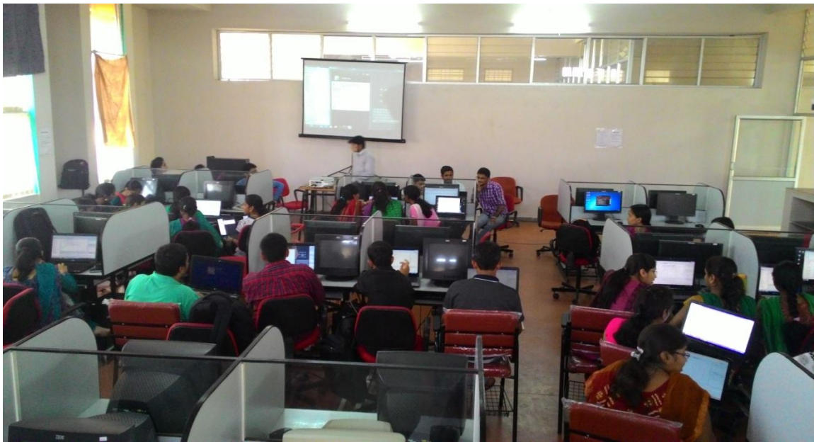
Two Day Workshop on 7 th and 8 th of March 2015 on Android Software Development