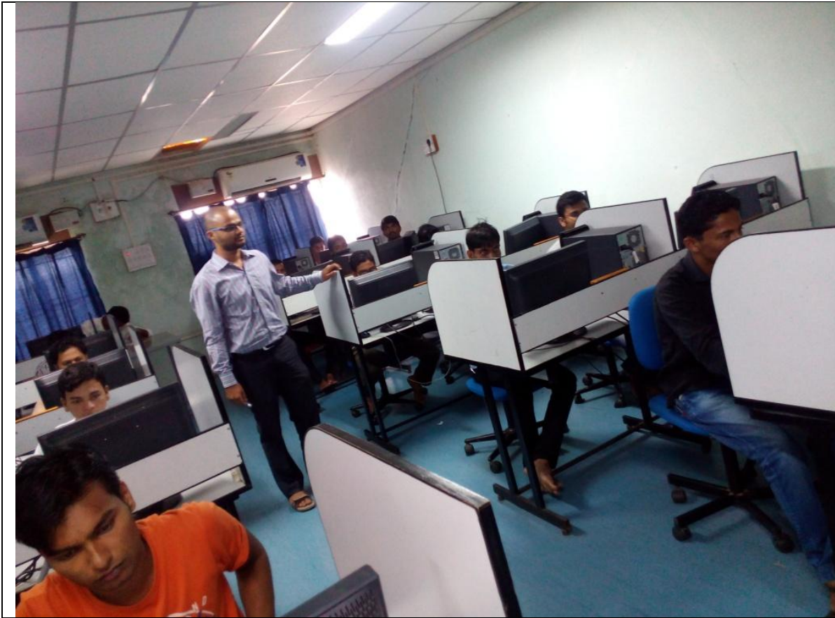
Photo of CATIA and HYPERMESH Training session in our CAED lab for Mechanical Engineering students