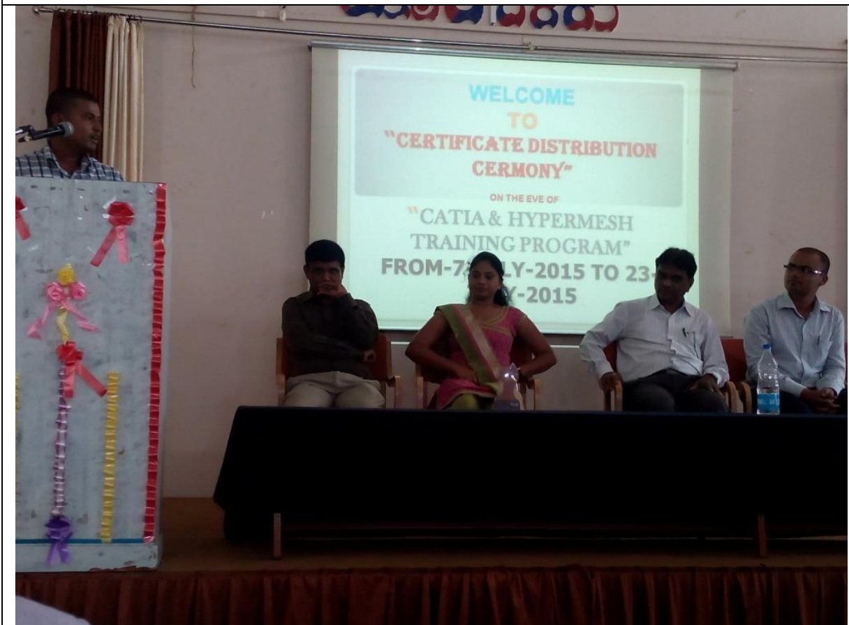
Photo of CATIA and HYPERMESH certificate distribution ceremony held in mechanical engineering department HSIT Nidasoshi on 23 rd July 2015 for Mechanical Engineering students