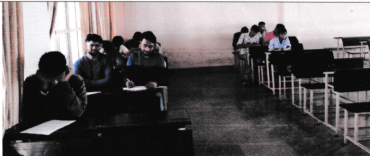
5 th semester students a ended the Awareness Session on the Importance of Personality Diagnos c Test and its Outcomes held on 6 th December 2021.