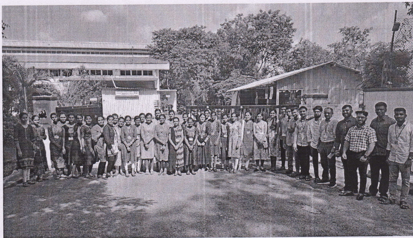
Visit to Kaynes Technology, Mysuru