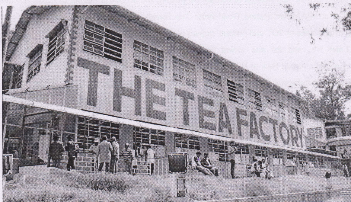
Visit to Doddabetta Tea Factory & Museum, Ooty