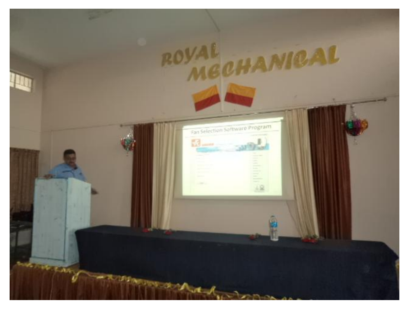
Technical Seminar on Boiler Fan manufacturing on