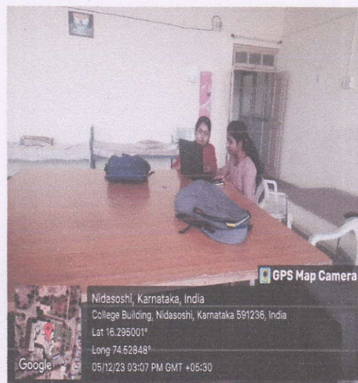
Room with Table, Chair, Bed, Mirror, Handwash