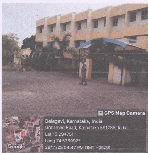
Security Guard at Girls Hostel