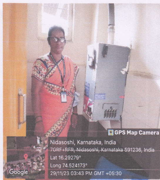
Sanitary Napkin Vending and Incinerator Machine