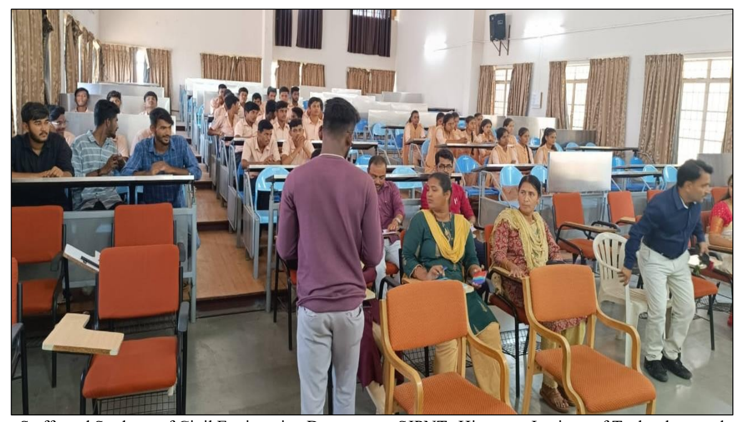
Staffs and Students of Civil Engineering Department, SJPNTs Hirasugar Institute of Technology and Civil Engineering Department, SJPNTs Polytechnic, Nidasoshi, gathered for FTP and STP Program