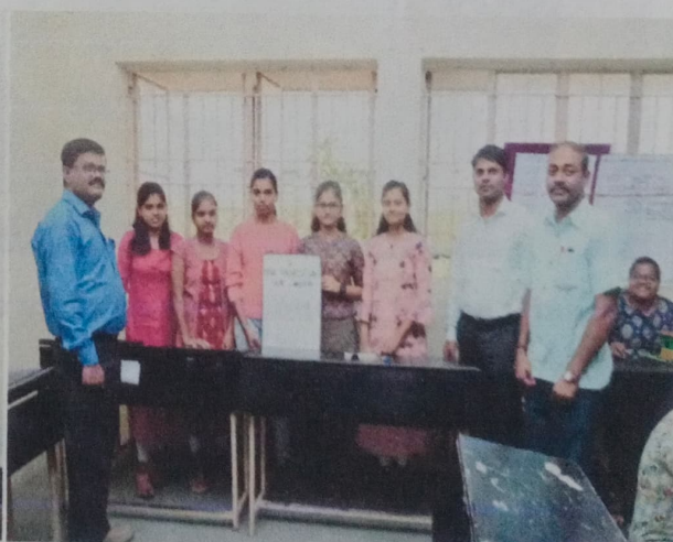
Presenttion of Proejects by the students