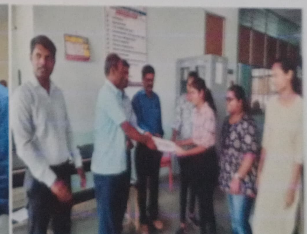
Presentation of Projects by the students and Prize distribution to the Winners