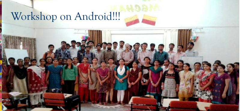
Workshop on Android!!!