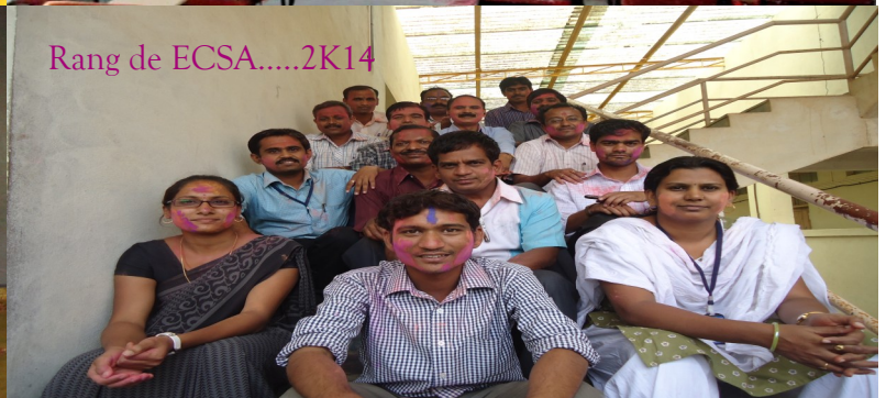
Rang de ECSPA.....2K14