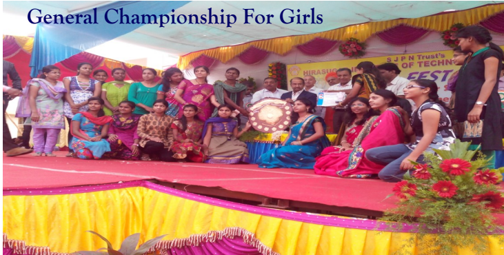
General Championship For Girls