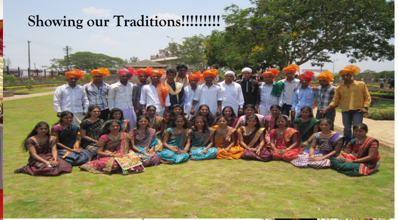
Showing our Traditions!!!!!!