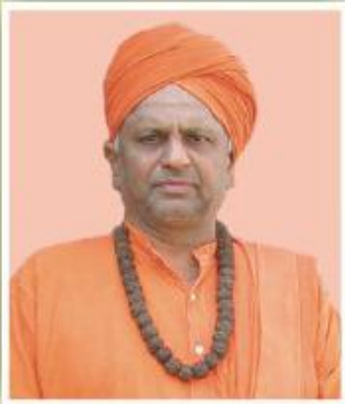
PRESIDENT S.J.P.N. TRUST, NIDASOSHI

‘ಜಾಗತೀಕರಣ’ ಇಂದು ವಿಶ್ವದ ಬಹುದೊಡ್ಡ ಬೆಳವಣಿಗೆಯಾಗಿದೆ. ಹಾಗಾಗಿ ಇದರ ಗುರಿಗಂತವ್ಯಗಳನ್ನರಿತು ವಿದ್ಯಾರ್ಥಿಗಳು ಸಾಗಬೇಕಾಗಿದೆ. ಈ ಹಿನ್ನೆಲೆಯಲ್ಲಿ ನಮ್ಮ ಟ್ರಸ್ಟಿನ ಹಿರಾಶುಗರ ಇಂಜಿನೀಯರಿಂಗ್ ಮಹಾವಿದ್ಯಾಲಯದ ವಿದ್ಯಾರ್ಥಿಗಳು ಗುರಿಯನ್ನು ದಟ್ಟವಾಗಿಸಿಕೊಂಡು ಪ್ರತಿಭೆಗಳಲ್ಲಿ ಮೆಲುಗೈ ಸಾಧಿಸುತ್ತಿರುವುದು ಹೆಮ್ಮೆ ಎನಿಸಿದೆ. ವಿಶೇಷವಾಗಿ ವಿದ್ಯುನ್ಮಾನ ಮತ್ತು ಸಂಪರ್ಕ ವಿಭಾಗದ ವಿದ್ಯಾರ್ಥಿಗಳ ಸಾಧನೆ ಅಚ್ಚರಿ ಪಡುವಂತಹದೇ ಆಗಿದೆ. “ವಿದ್ಯಾರ್ಥಿಗಳ ಸಾಧನೆಯೇ ಸಂಸ್ಥೆಯ ಅಭಿವೃದ್ಧಿ” ಈ ನೋಟವಾಗಿ ಸ್ಮರಣ ಸಂಚಿಕೆ ಹೊರಬರುತ್ತಿರುವುದು ಸಂತೋಷದ ಸಂಗತಿ. ಮತ್ತಷ್ಟು ಮತ್ತಷ್ಟು ವಿದ್ಯಾರ್ಥಿಗಳು ಜ್ಞಾನ ಹೊಂದಿ "ವಿಶ್ವದ ನಿರ್ಮಾತ್ಮಗಳು" ಎಂಬ ಭಾಷೆಗೆ ಭಾಷ್ಯ ಬರೆಯಲಿ; ಈ ಬಗೆಯಲ್ಲಿ ಶ್ರಮಿಸುವ ಹೆಜ್ಜಿನ ಶಕ್ತಿಯನ್ನು ಶ್ರೀ ದುರದುಂಡೀಶ್ವರರು ಎಲ್ಲ ಗುರು ವರ್ಗಕ್ಕೆ ನೀಡಲೆಂದು ಆಶಿಸುತ್ತೇವೆ.