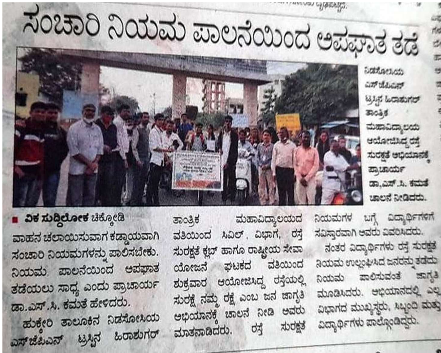
Vijay Vani Paper article dated: 15/01/2022