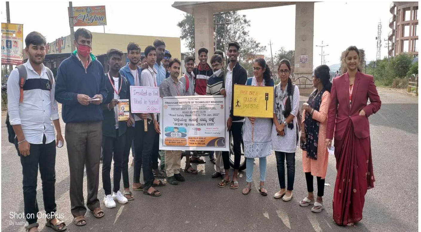
Civil Dept. Staff and Students with road users near Nidasoshi Gate Circle