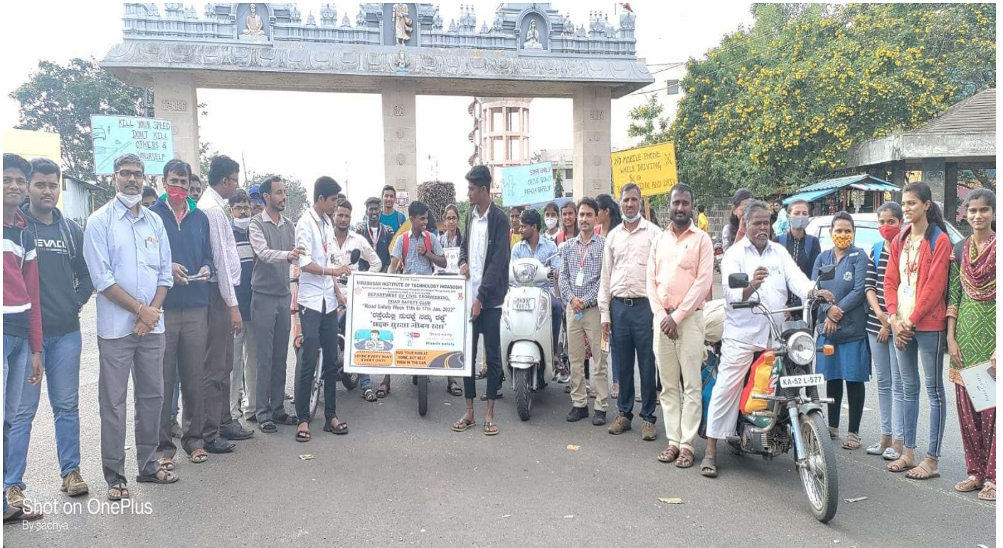
All Staff and Students delivering road safety awareness for road users