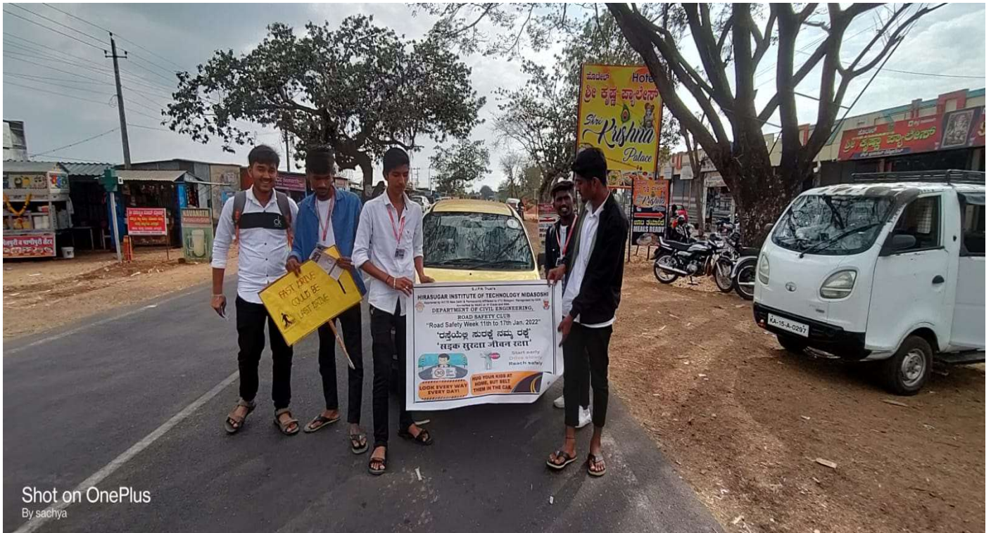
Students speaking on road safety awareness with Drivers of Four-Wheelers