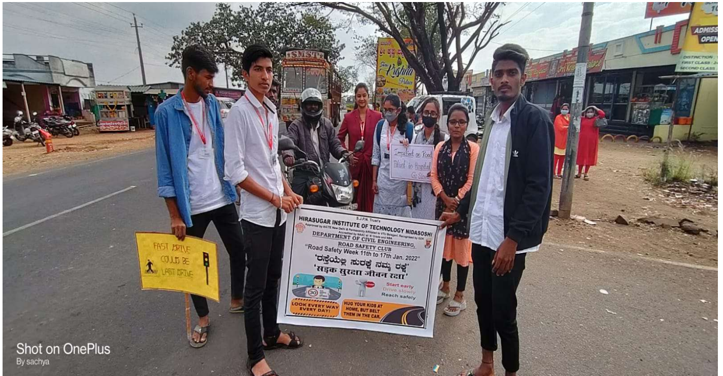
Students speaking on road safety awareness with Two-Wheeler Riders