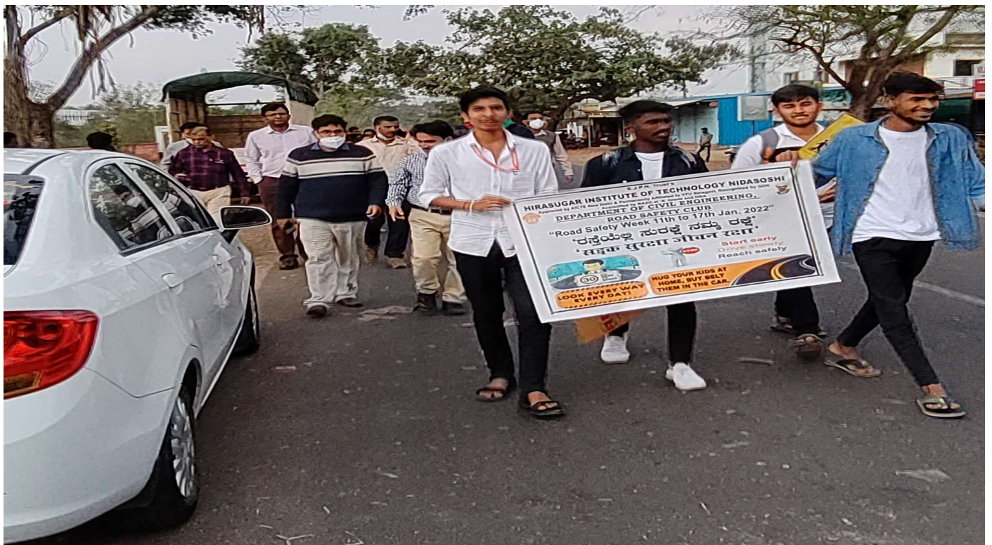
Staff and Students delivering road safety awareness for road users