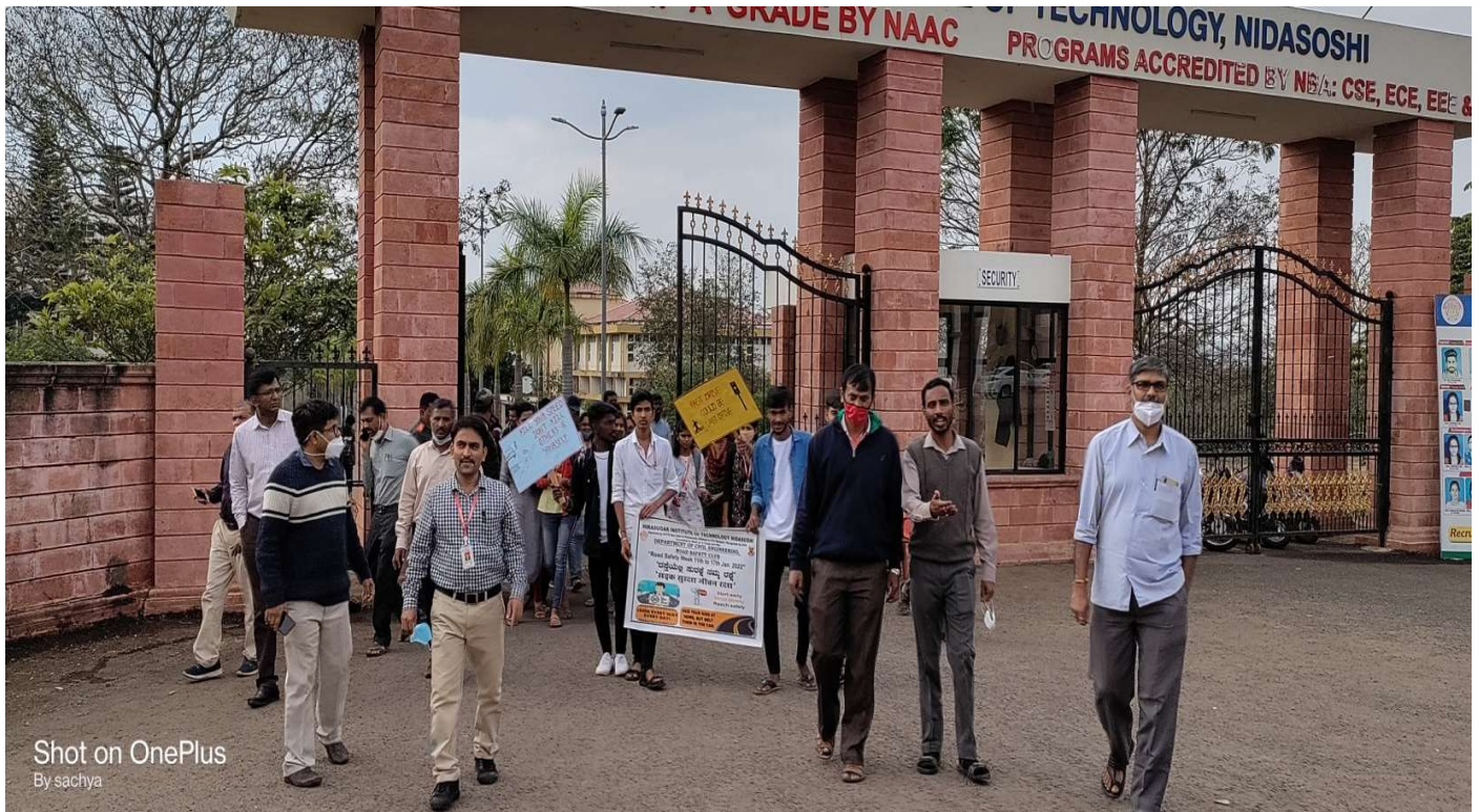
Staff and Students moving towards campaigning spots.