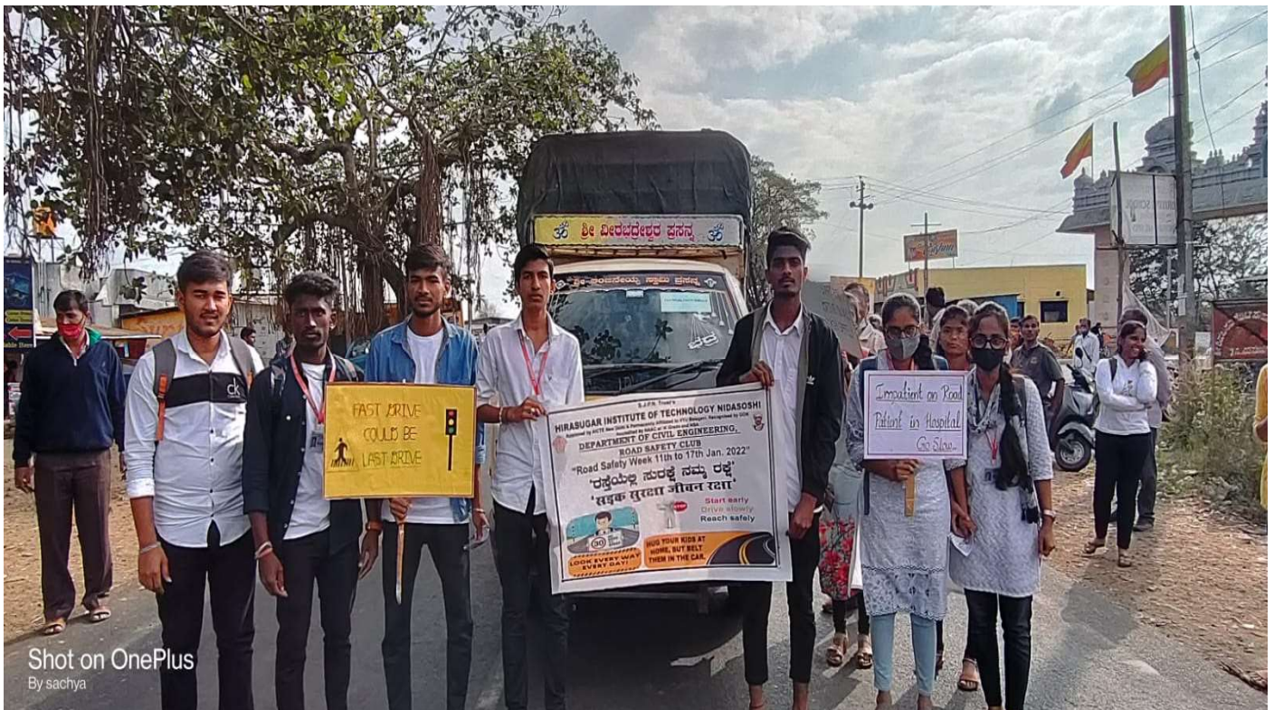
Students speaking on road safety awareness with Drivers of Goods Carriers.