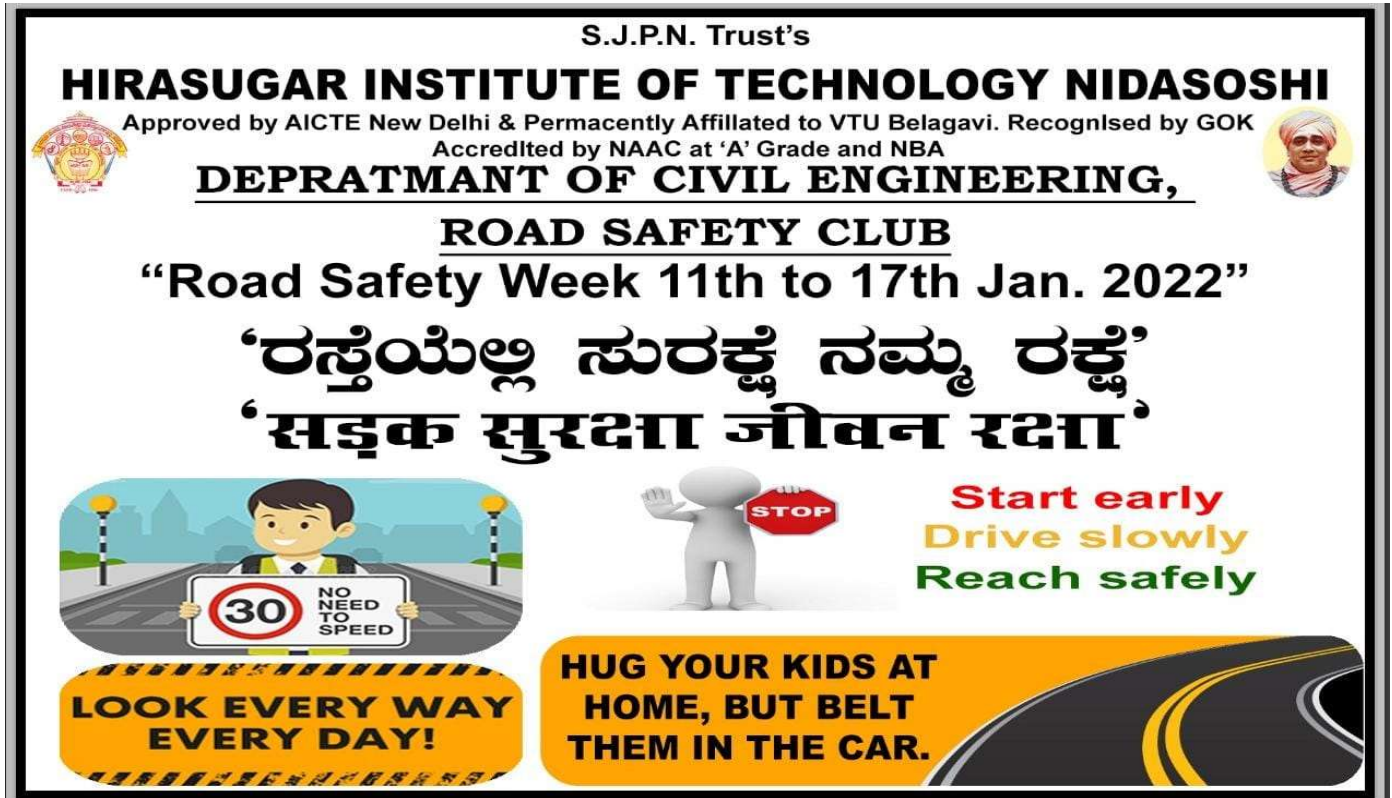
Banner for Road Safety Awareness Campaign