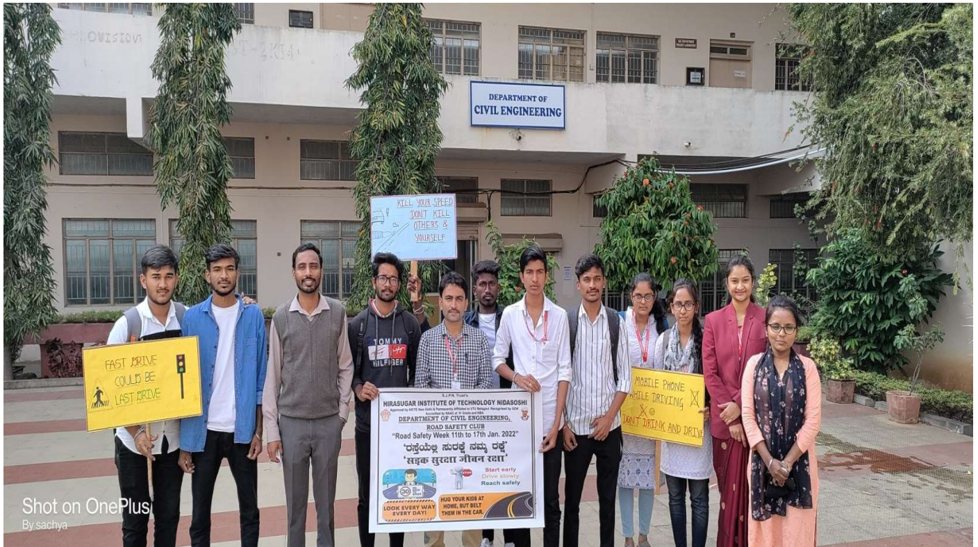
Department of Civil Engineering, Staff and Students on the Activity Day.