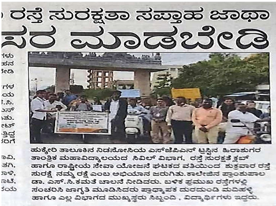
V K Sudhiloka Paper article dated: 15/01/2022 and Road Safety Club WhatsApp Group